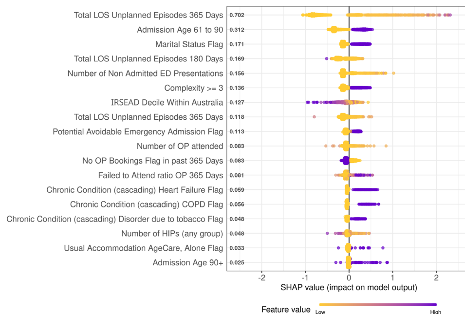
Figure 3 SHAP plot of impact of each feature on decision of XGBoost model. COPD, chronic obstructive pulmonary disease; ED, Extreme Gradient Boosting; HIP, Health Independence Program; LOS, Length of Stay; OP, outpatient; IRSEAD, Index of Relative Socio-economic Advantage and Disadvantage; SHAP, Shapley Additive exPlanations; XGBoost, Extreme Gradient Boosting.

past resource use (unplanned admissions, avoidable emergency presentations and failure to attend OP appointments). Figure 3 provides a SHAP plot of each of the 18 variables.